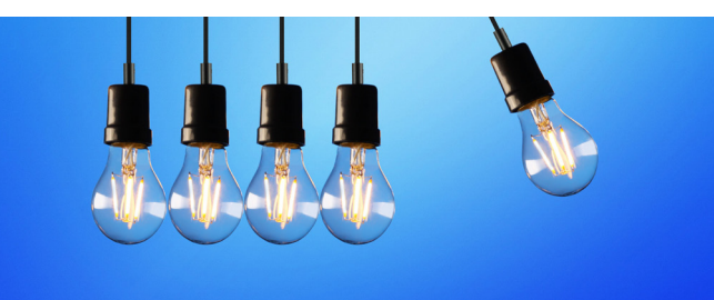
ELECTRICAL SYSTEMS: A BUSINESS PURCHASES A COMMERCIAL PROPERTY AND INCURS EXPENSES FOR INSTALLING NEW ELECTRICAL WIRING, LIGHTING SYSTEMS, AND POWER SOCKETS; THEY CLAIM EMBEDDED CAPITAL ALLOWANCES FOR THESE QUALIFYING EXPENDITURES.

FIRE SAFETY EQUIPMENT: A HOTEL OWNER INVESTS IN A COMPREHENSIVE FIRE SAFETY SYSTEM, INCLUDING FIRE ALARMS, SMOKE DETECTORS, AND SPRINKLER SYSTEMS, AND CLAIMS EMBEDDED CAPITAL ALLOWANCES FOR THE COSTS OF THESE INTEGRAL SAFETY FEATURES.